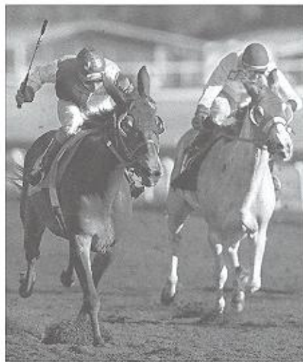
The Press Democrat, 2000

Lover's Soul . Finally, she is likely the only mule to have a song written exclusively about her: "Black Ruby Fever" (Gary Hyde Music BMI).